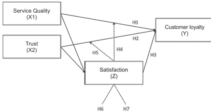
Figure 1. Framework